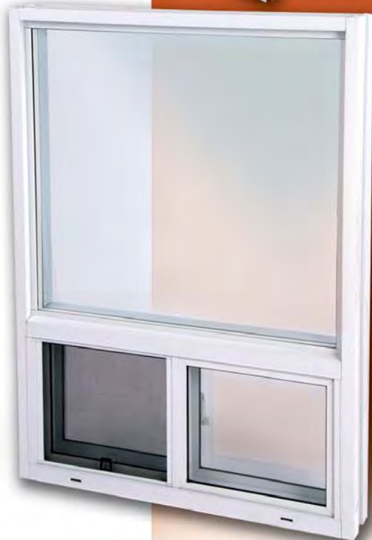
The Alton Aluminum Combination Window