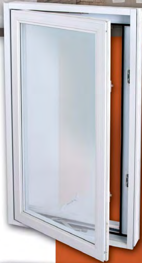
The Alton Aluminum Casement Window